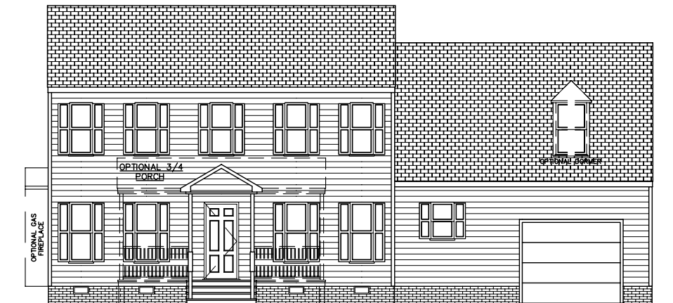
FRONT ELEVATION - basic