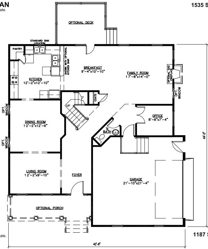
FIRST FLOOR PLAN All room dimensions shown are approximate.